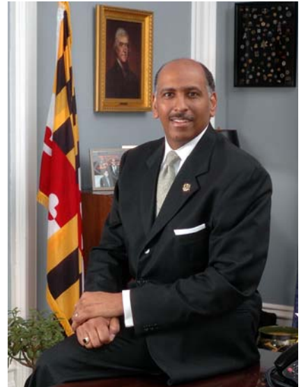
The Honorable Michael S. Steele, Lt. Governor

We are pleased to present the annual report for the Maryland Commission for Women. The Commission is charged with expanding social, political and economic opportunities for women. During the past year, the Commission has continued that mission and has served all Maryland residents through its efforts.