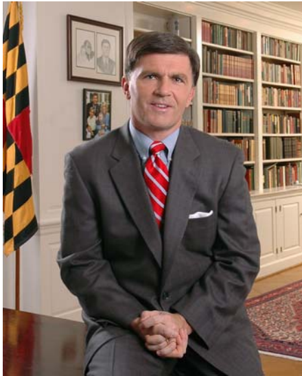
The Honorable Robert L. Ehrlich, Governor