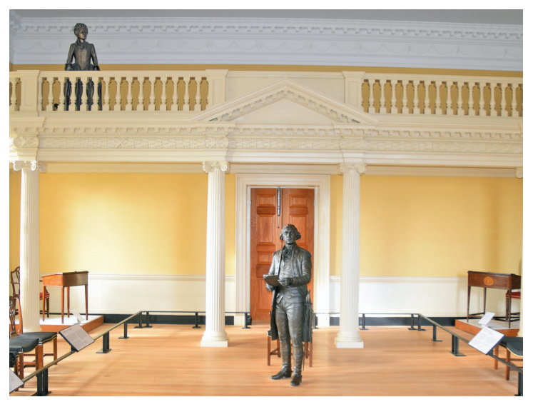
The Old Senate Chamber with bronze statues of George Washington and Molly Ridout

The arrangement of the furniture reflects the way the room looked on December 23, 1783 according to carefully researched protocols for important Congressional events in the late 18th century. Washington is shown facing the dais