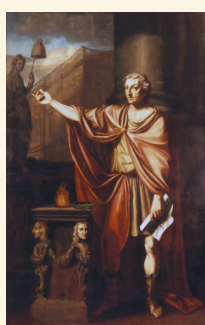
William Pitt (Lord Chatham) by Charles Willson Peale, 1768 Westmoreland County Museum Montross, Virginia

The portrait originally hung in the Old Senate Chamber and was there when Congress met in Annapolis in 1783-84. It has, over the centuries, had several different locations within the State House. With the restoration of the Old Senate Chamber in 2014, this portrait was returned to its original, historic location over the fireplace in the chamber.